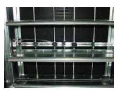
Pressure Pick-Up Tubes

m = a damper specific exponent that is provided with the unit